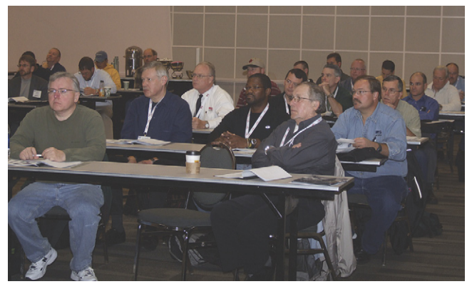
Conference attendees at one of the four short courses

The short courses included: a Master Class in the art of Phased Array Data Analysis addressing Detection, Characterisation and Finite Sizing of Welding Flaws; Measuring and Improving Inspection Performance; Applied Thermography for Non-Destructive Testing; and Introduction to Failure Analysis.