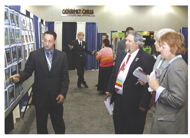
Student poster session

The 2009 conference brought together the international community of professionals who exchanged ideas to further the profession.