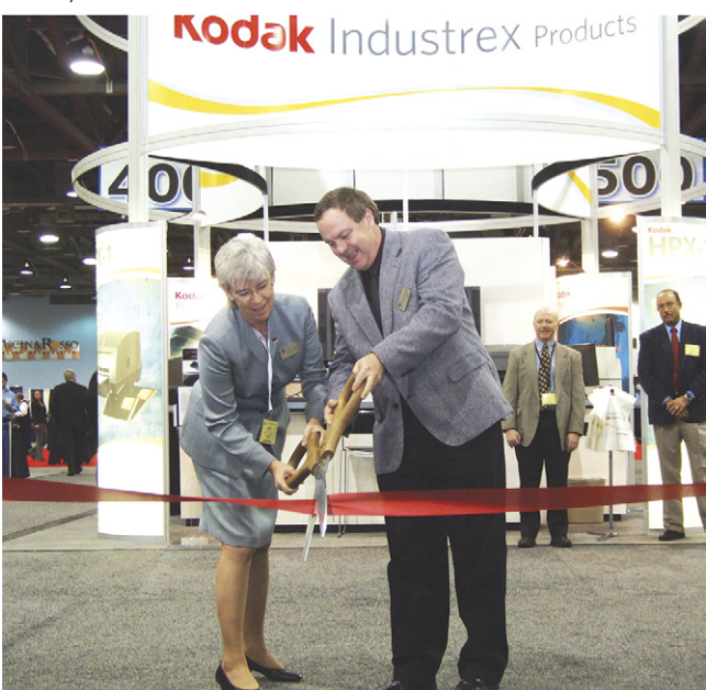
The Quality Testing Show 2009 is officially opened

The ASNT Fall Conference & Quality Testing Show 2009, Destination Columbus, was held 19-23 October 2009 in the Society's hometown of Columbus, Ohio, USA.