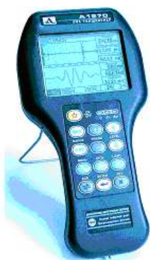
Fig. 1. View of EMA thickness gauge

Thickness inspection of airframes and other parts of space launch vehicles is one of the main quality control demands to provide highest reliability of complex products, produced by the spacecraft industry. The measuring error of the mostly applicable ultrasonic thickness measurement method in this case depends on the range of specific features of the object, such as velocity variation of ultrasonic waves propagation in the material, state and geometry of object, quality of acoustic contact when using piezoelectric transducers, environmental temperature and other. Therefore the use of contact thickness gauges reduces the efficiency and quality of inspection. Due to the large volumes of inspecting areas and high requirements to the accuracy of wall thickness measurements on fairing and paneling, used for covering the “PROTON” launch vehicle’s body, it was necessary to develop a generally new method and new instrument, that would allow the enough speed of inspection and high accuracy of measurements. Basing on the technical specification prepared by Khrunichev State Research and Production Center to solve the above mentioned task JSC Spectrum-RII has developed Electro-Magnetic Acoustic thickness gauge A1270 (fig. 1). The EMA technology featuring the excitation and reception of shear horizontally-polarized ultrasonic waves with radial and linear polarization in frequency range of 2.5-5 MHz allows inspection of alloys produced using different technologies.