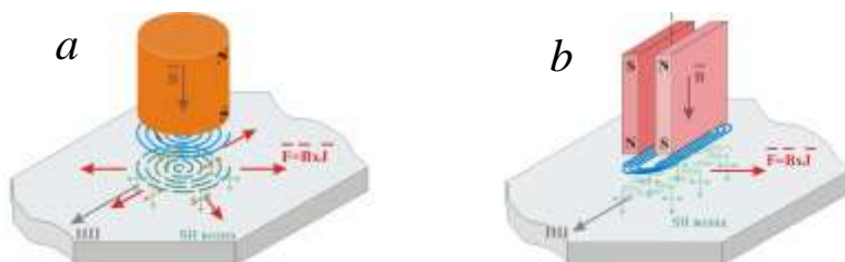
Fig. 3. EMA principle of excitation of shear horizontally-polarized waves with radial (a) and linear (b) polarization

\vec{H} - magnetic field strength, \vec{J} - eddy current. This disturbance is transferred to the lattice of the material, producing an elastic wave. In a reciprocal process, the interaction of the elastic wave in the presence of a magnetic field induces currents in the receiving. Depending on construction of the coil and orientation of polarization field the transducer can excite SH waves of