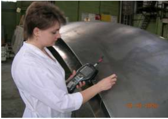
Fig.6. Wall thickness measurements of panel of launch vehicle "PROTON"

The experience received after a long exploitation of the instrument A1270 in the industry allowed setting the ultrasonic velocity range for the alloys used in the production, depending on the aluminum type, delivery party and for the specific production parts.