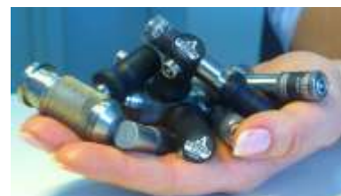
Fig. 2. EMATs

The main operation principle of EMA thickness gauge is sending and reception of ultrasonic waves to the object using the impact of alternative and direct magnetic fields on the object’s surface. A high frequency signal is applied to the EMAT coil (fig. 3) to induce eddy currents on the surface of the material. The surface currents interact with the magnetic field to generate a Lorentz force. The volume density of Lorentz force is \vec{F} = \vec{J} \times \vec{B} , where \vec{B} = \mu\mu_0\vec{H} - induction of magnetic field in the inspected metal, \mu - relative magnetic of the metal, \mu_0 - vacuum permeability,