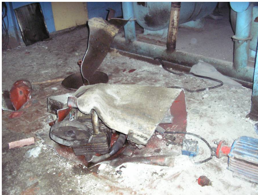
Fig. 5 Compressor Unit after Destruction

OOO NPP Mechanic experts took part in investigation of the accident root-causes. In the process of examination, the following was found out. The receiver body was destroyed mainly along the welded joints, and the receiver shell plate was torn and rolled outside (Fig. 5). The fact that all welded joints were destroyed precisely along the thermal effect zones indicates high enough quality of welding work performed on the tank. Macro-examination of the fracture surfaces did not reveal any major defects in the joints and confirmed that they had the fine-grained structure. Absence of plastically deformed metal on fracture edges definitely indicated a brittle nature of fracture. The drive end of the compressor crankshaft was cut at the fillet connection point. Macro-examination of the cut section of the crankshaft showed that it had the structure typical for a brittle fracture. Large quantity of oil crust was detected in the valve chamber from the I stage side as well as on the inner surface of the discharge pipe of the I stage. The paint and lacquer coating of all pipes was burned, which indicated that they had been exposed to high temperature. The back-flow valve installed on the discharge pipe of the II stage was destroyed. The pressure-relief valves of the I and II stages were torn off the sockolets.