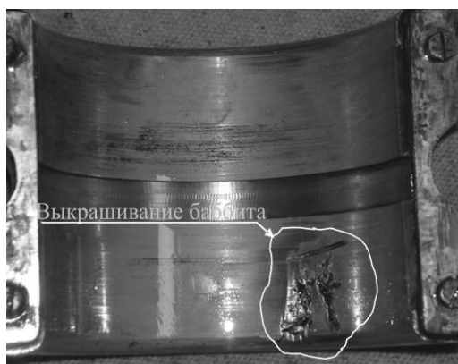
Fig.1 Defect of Half-Liner of Rod Bearing of NA-20 Compressor, Position No.35-II

Diagnostic of the compressors revealed the following: typical diagnostic indicators of damage of rod-bearing liner were observed on the main bearing covers (caps). Visual examination performed after disassembling this unit confirmed that “diagnosis” (Fig. 1). After the first of the compressors was repaired, the vibration parameters have decreased significantly. The report shows time realizations and spectra before and after repair of the liner (Fig. 2). The spectral characteristics indicated presence of several harmonics multiple to frequency of about 285 Hz. According to the examination results this frequency features the state of a rod bearing.