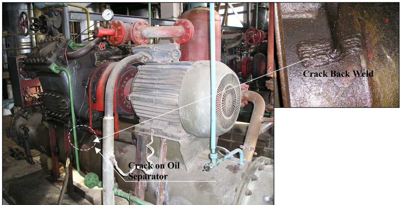
Fig. 4 Compressor Unit with Crack on Tank

The report shows the instances where cracks occurred in places where a compressor unit frame was welded to a tank. As an example, Fig. 4 shows a system incorporating 2P-110 compressor. There also were some cases when fatigue cracks occurred in the similarly designed systems incorporating screw ammonia compressors.